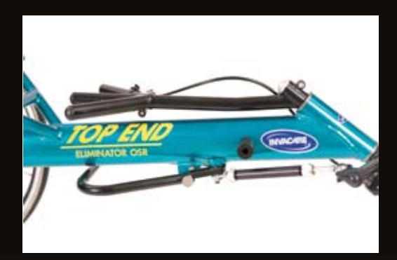
The precision track compensator system ensures maximum speed on the road and around each turn of the track.