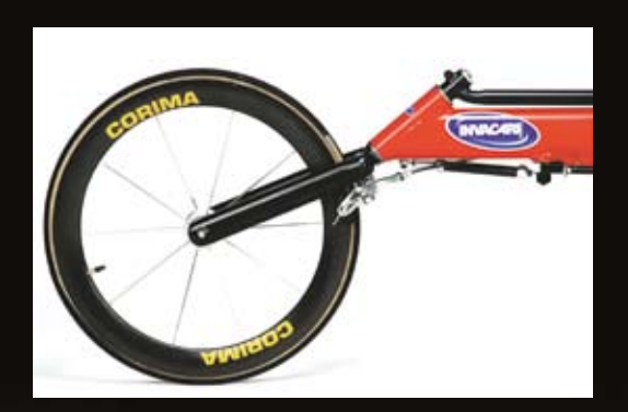
Oversized rake for maximum speed and cornering.