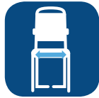
Seat width ▼