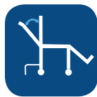
Tilt angle back ▼