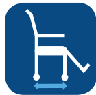
Seat depth ▼