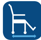
Total depth ▼