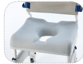
Seating and Backrests