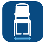
Total width ▼