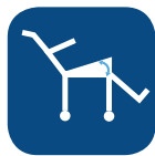
Tilt angle seat ▼